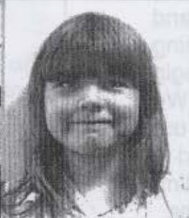
HEC Union supporter who attended our last committee meeting