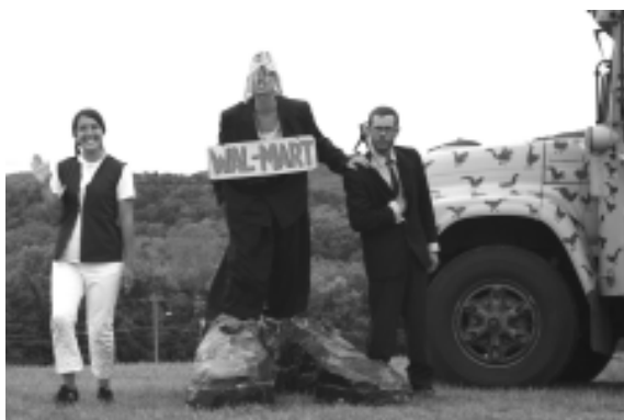
In this enactment by Bread and Puppet Wal-Mart prepares to stomp out locally owned businesses.

In 1974 the Theater moved to a farm in Glover in the Northeast Kingdom of Vermont. The 140-year-old hay barn was transformed into a museum for veteran puppets. The Domestic Resurrection Circus, a two-day outdoor festival of puppetry shows, was presented annually through 1998.