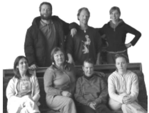
Nonotuck staff take a moment from their meeting to relax in front of the camera.