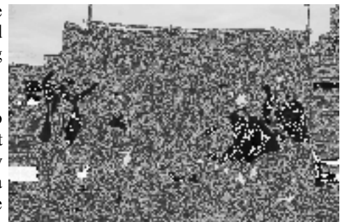
Performers showing their vision of governmental greed at a weekend event in Amherst, MA.

In 1970 Bread & Puppet moved to Vermont as theater-in-residence at Goddard College , combining puppetry with gardening and bread baking in a serious way, learning to live in the countryside and letting itself be influenced by the experience.